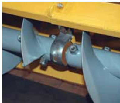
Durable Carrier Bearings

Sturdy-Built Sweep Structure includes front and rear jacks to help the sweep withstand the stored grain pressures generated inside large diameter and/or taller grain bins