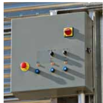
Optional Sweep Controller