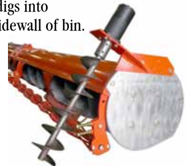
Optional Sidewall Material Agitator