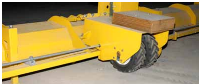
Sweep Drive with Foam-Filled Dual Wheels