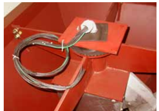
Optional BROCK® Collector Ring Assembly