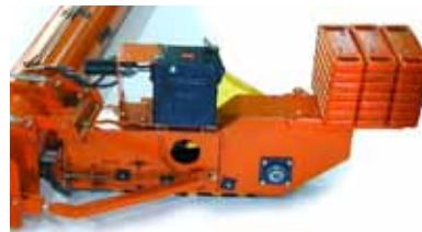
Optional Track Drive